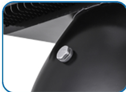
Breathing device for hot air discharge