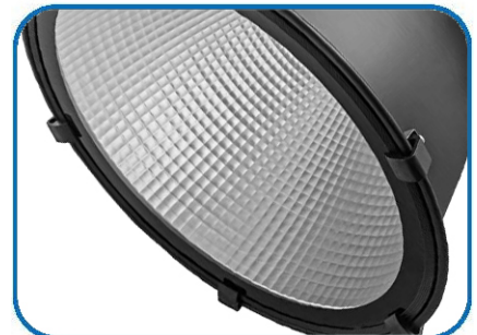
High reflectivity faceted in vivo reflector