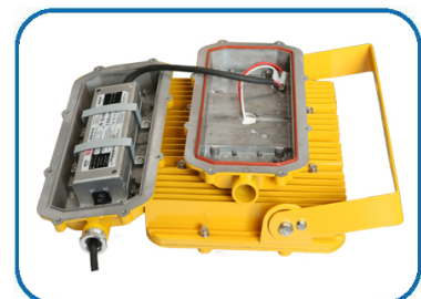
two cavity separation design